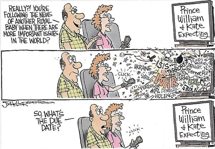
JOE HELLER • GREEN BAY PRESS-GAZETTE • POLITICALCARTOONS.COM